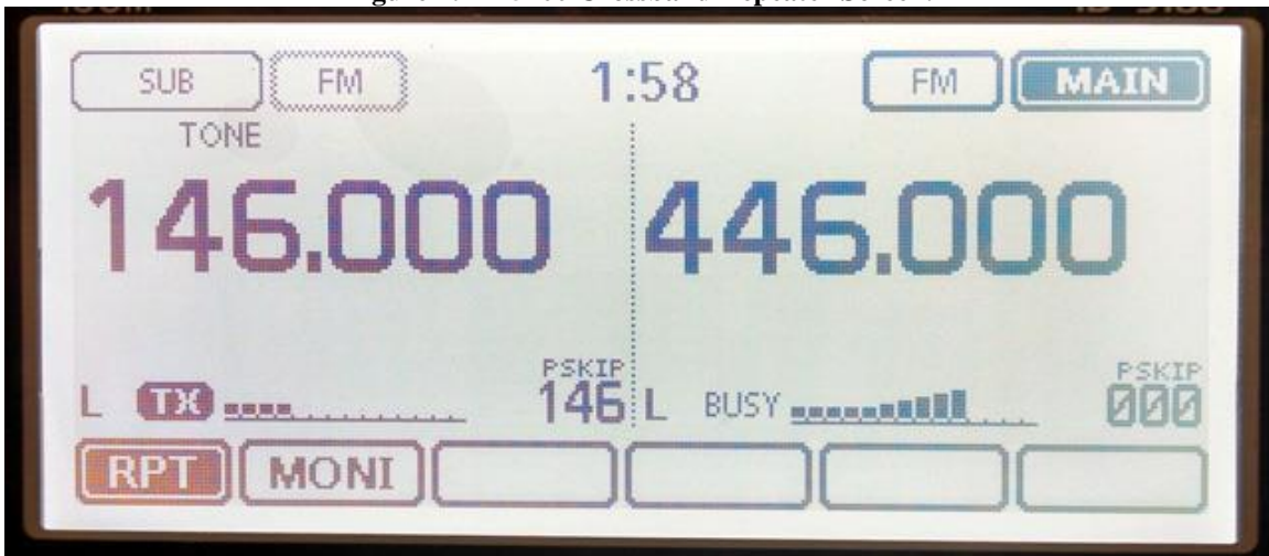
Figure 4: ID-5100 Crossband Repeater Screen.