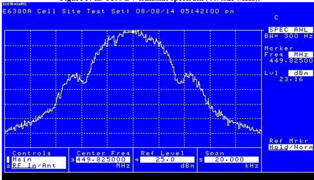
Figure 3: ID-5100 DV transmit spectrum (449.825 MHz).

Test Conditions: 144 and 446 MHz, FM, P_o = 15\text{W} (MID). Center freq. & span as shown in Figure 3 . Occupied bandwidth \approx 6\text{ kHz} at the -26\text{ dBc} points.